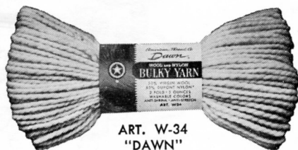
ART. W-34 "DAWN"