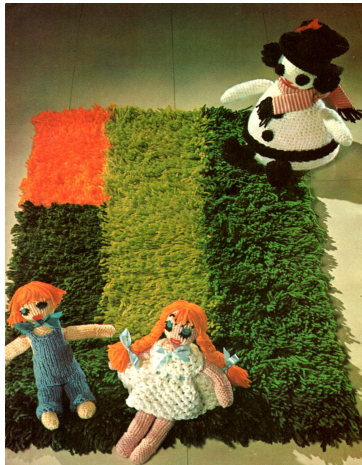
Fringe Rug Continued