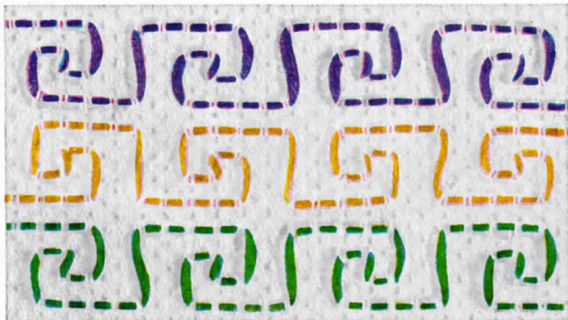
1 Skein ea. Lt. Emerald, Orange, Heliotrope.