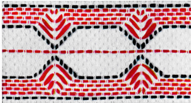
1 Skein ea. Bright Red and Black.