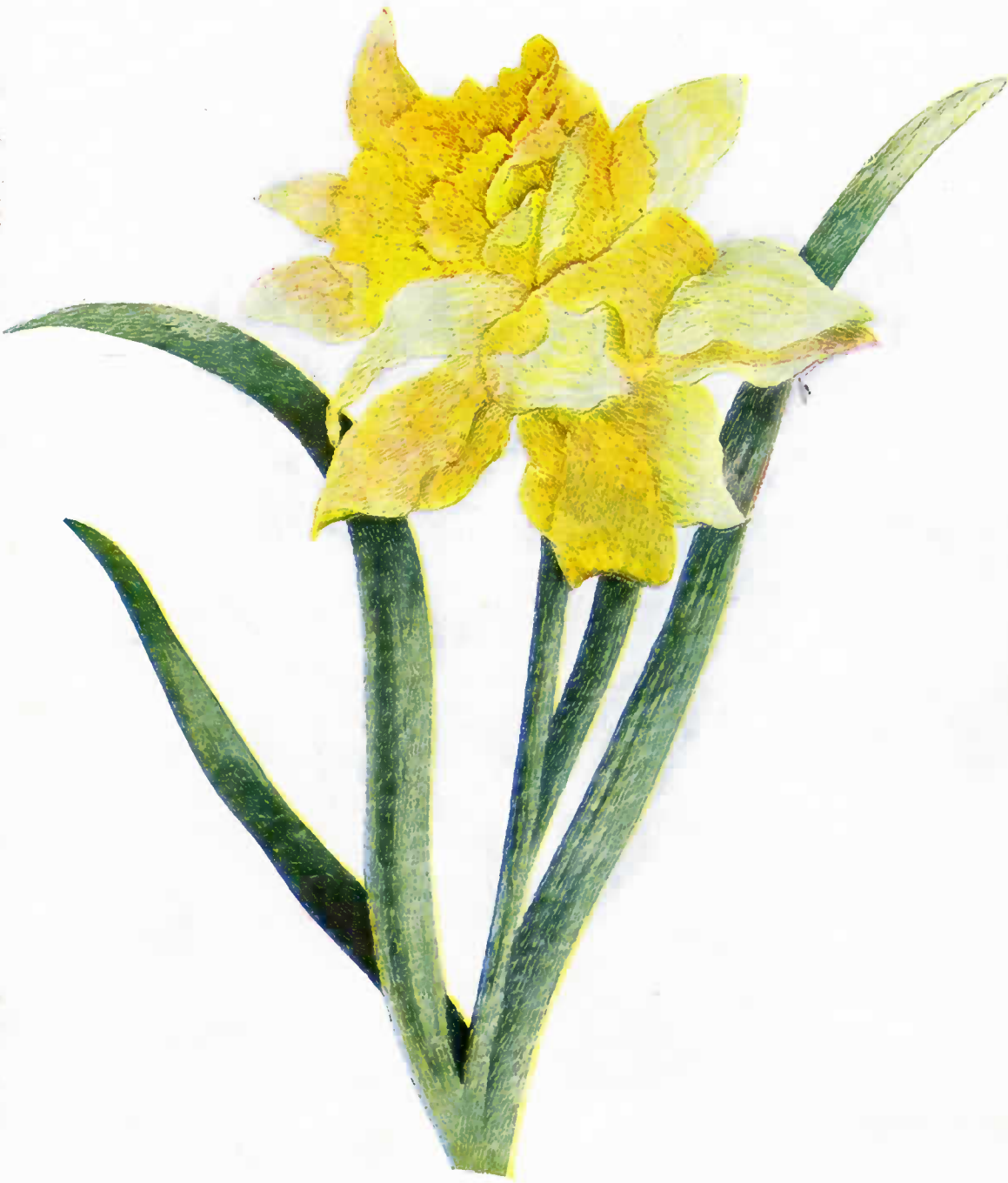
PLATE LVI DAFFODIL