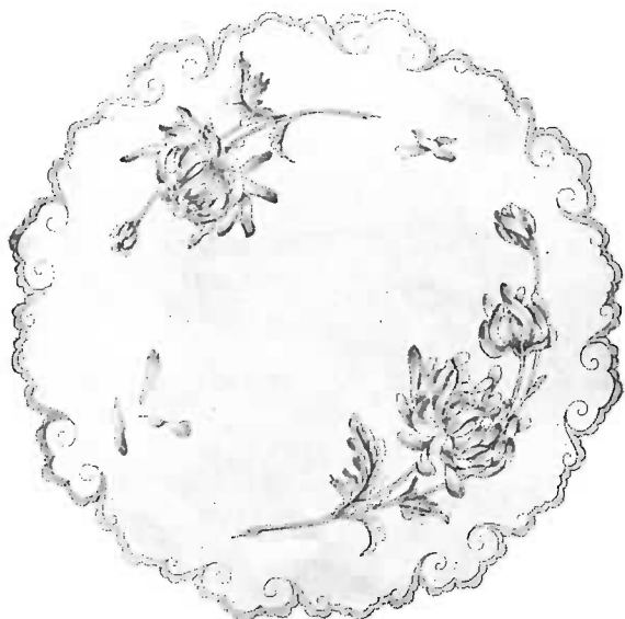
Fig. 323. Chrysanthemum.

This flower grows in many beautiful colorings, pink, white and yellow being